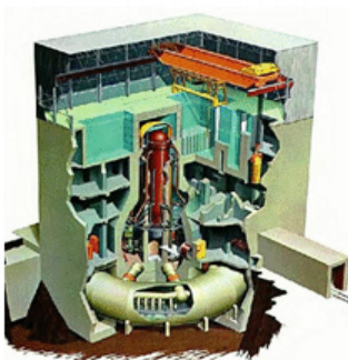
GE BWR Mark 1

Key lessons will be discussed, including issues related to plant design basis (i.e. accident scenarios), reactor design and engineering, operations and regulations, as well as government response and public notification.