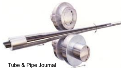
Tube & Pipe Journal

Nuclear-grade zirconium alloys and products are used in the fabrication of fuel assemblies for the vast majority of current and future nuclear reactors around the world. A renewed growth trend has emerged for nuclear power in light of the global energy transition, and thus the global supply chain of nuclear-grade zirconium – from zircon mineral sand through the cladding and components used in finished fuel assemblies – requires renewed analysis. Therefore, the primary objective of this report is to factually and analytically approach the current and expected future direction of the nuclear-grade zirconium market to help formulate clear conclusions about how nuclear fuel fabricators will obtain the zirconium needed to create their finished products.