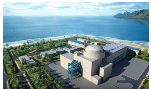
China's Hualong-One (HPR-1000) reactor design