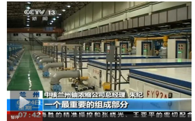
China's Lanzhou Enrichment Plant