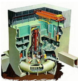
GE BWR Mark 1

Key lessons will be discussed, including issues related to plant design basis (i.e. accident scenarios), reactor design and engineering, operations and regulations, as well as government response and public notification.