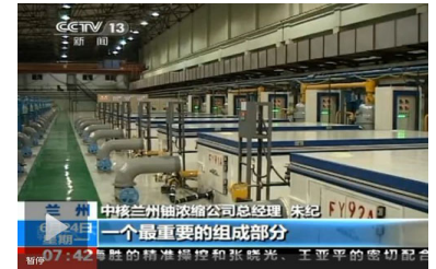
China's Lanzhou Enrichment Plant