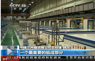
China's Lanzhou Enrichment Plant