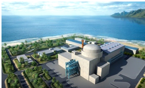
China's Hualong-One (HPR-1000) reactor design