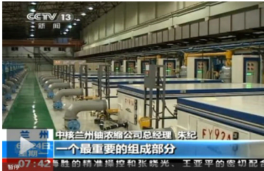
China's Lanzhou Enrichment Plant